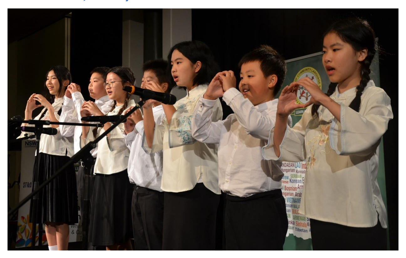
Get ready and be prepared for our 2nd COMMUNITY LANGUAGE SCHOOLS SPECTACULAR, SUNDAY 2 JUNE 2024, and celebrate our student's talents in all areas of art and creativity; singing, dancing, writing and other performances.