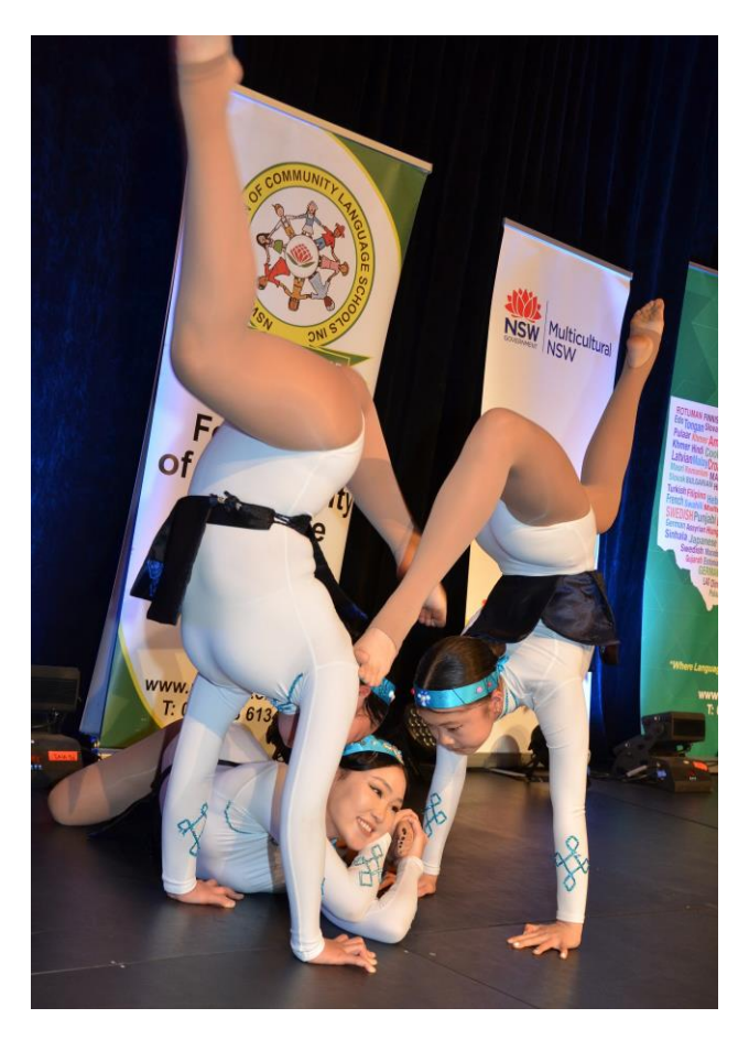
10 - Mongolian Language School