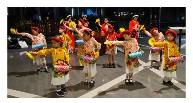
6 - Inner West Vietnamese Language School Inc