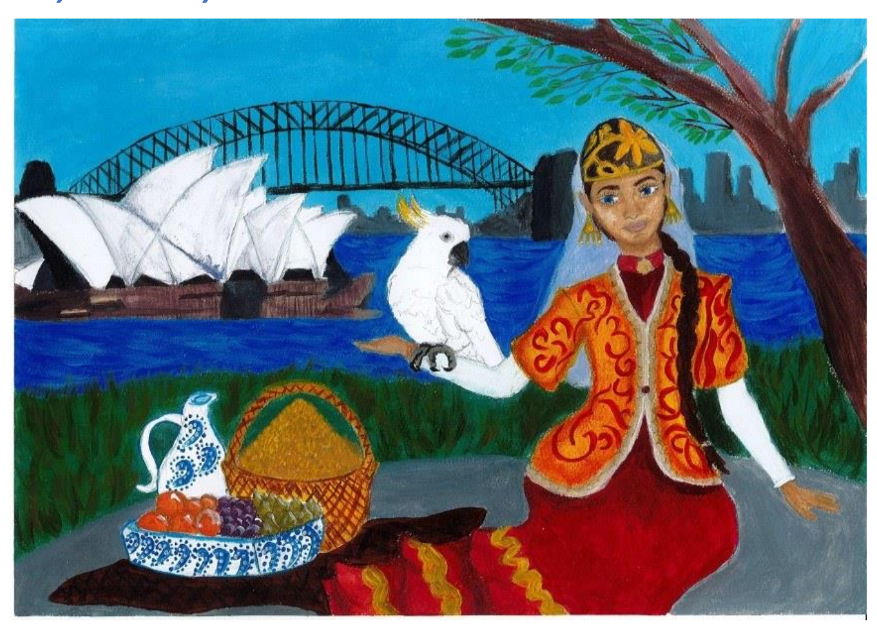
'My Community's Celebrations'