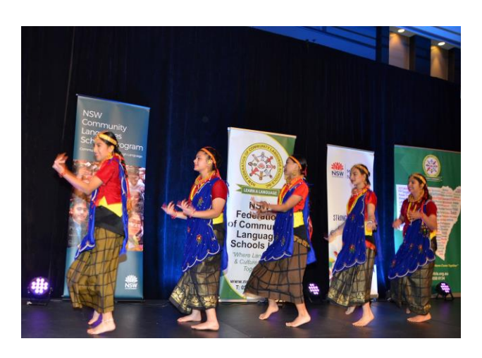
8 - Sabdamala-Nepalese Language School Inc