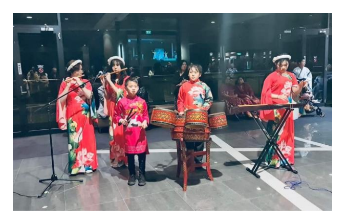
7 - Inner West Vietnamese Language School Inc