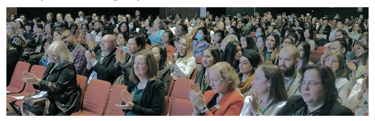
On Saturday 15 April, the Community Language Schools Conference was held successfully at the University of Technology Sydney with 548 participants.