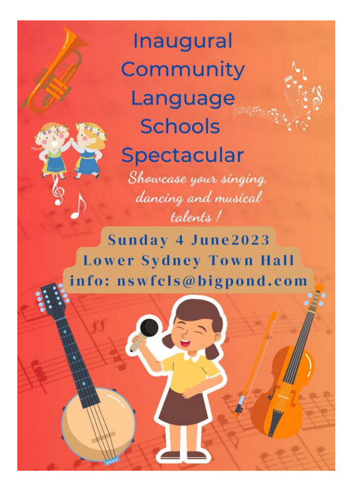
17 - COMMUNITY LANGUAGE SCHOOLS SPECTACULAR,

Sunday 4 June 2023, Lower Sydney Town Hall