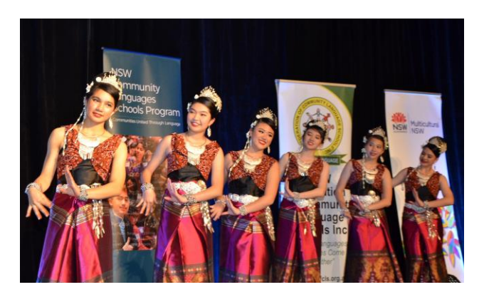
11 - Buddharangsee Thai Community Language School Inc